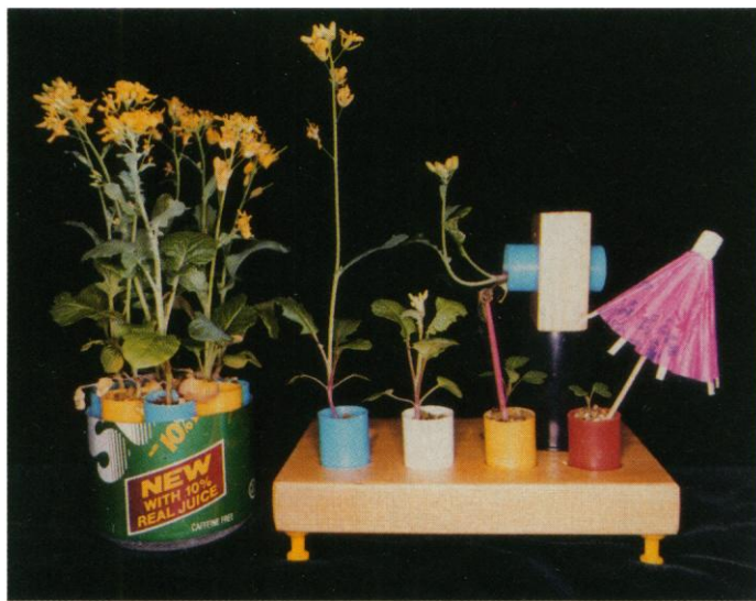
Fig. 3. Rapid-cycling Brassica campestris , CrGC-1. (Left) Seven plants growing in mini-pots. (Front) Progression of growth at 4-day intervals; a "bee-stick" pollination device is in the yellow pot (16). (Rear) Response of a 12-day-old plant after being placed horizontally for 2 hours to demonstrate geotropism.

The generation of embryos from cell cultures, known as somatic